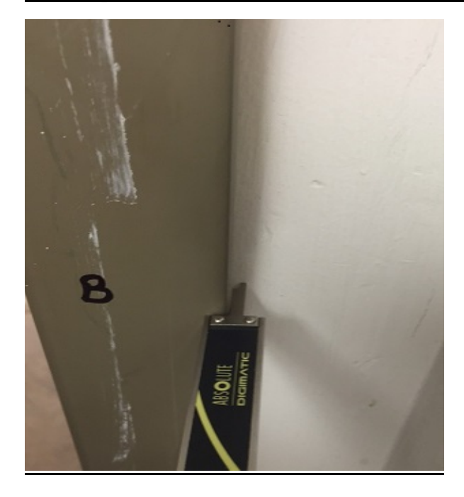
Please note: Each door frame should be measured individually to verify that there are no dimensional differences from door frame to door frame.